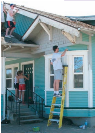
Volunteerism abounds in 2008 when members of the FSAA, with students from George Fox University, spruce up the home of a family dealing with illness. Projects like this provide local service events for both FSAA members and the public to give back to their communities.

The FSAA is dedicated to providing volunteer opportunities to positively affect the vitality of both rural and urban communities.