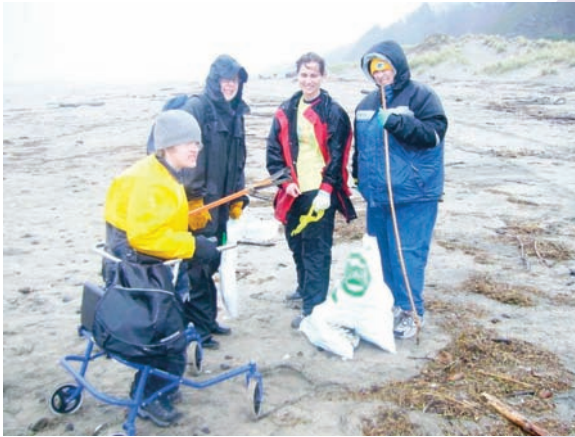
FSAA members pick up trash during the annual SOLV (Stop Oregon Litter and Vandalism) Great Oregon Spring Beach Cleanup, 2007.